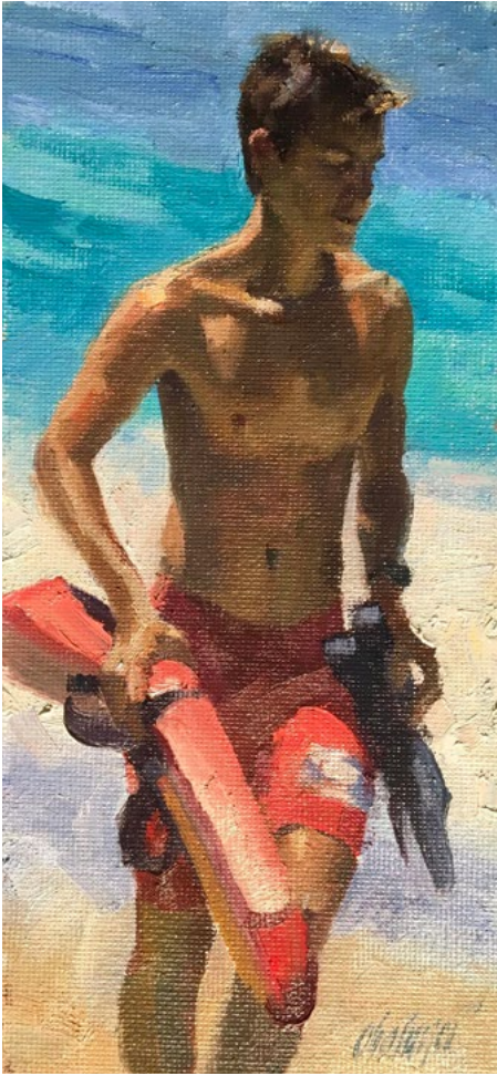
Laguna Guard | 3.5" X 8" | Oil