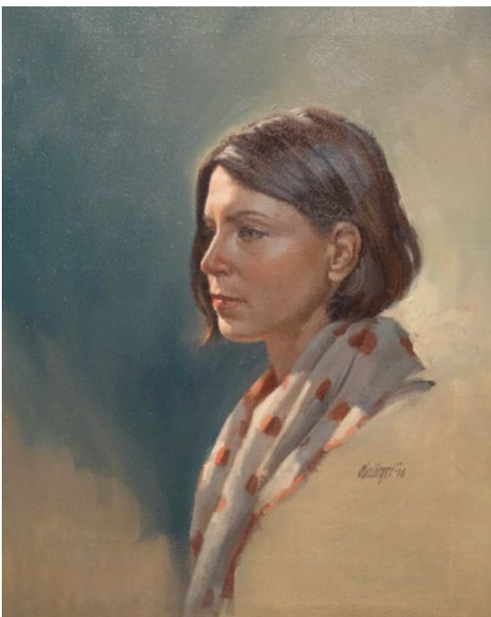
Lauren | 14" X 18" | Oil