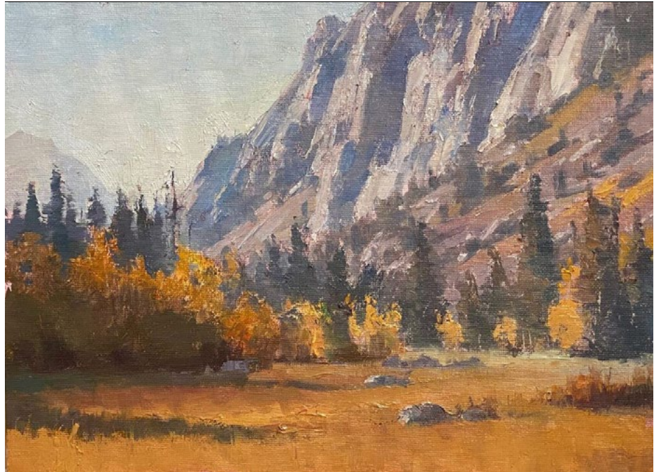
Golden Meadow | 12" X 9" | Oil