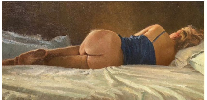
Late Morning | 20" X 10" | Oil