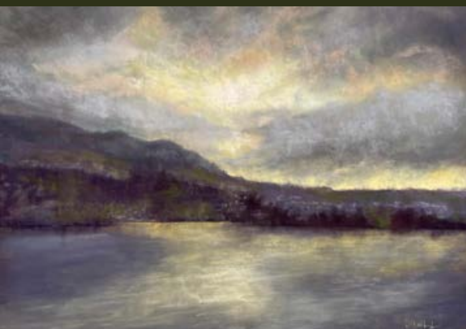
THE PASTEL PROCESS